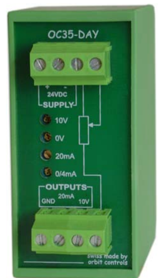
Model with front adjustments